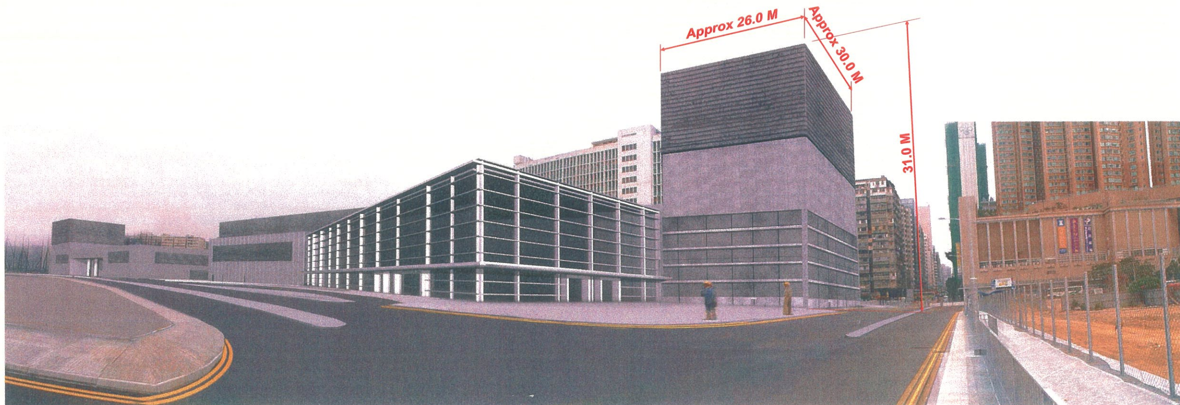
DAY 1 WITHOUT MITIGATION

NOTE: This drawing provides the aesthetic impression of the indicative form, size and quality of the architectural and landscaping treatment for the railway structures. The final details of layout, materials and finishes will be subject to detailed development.